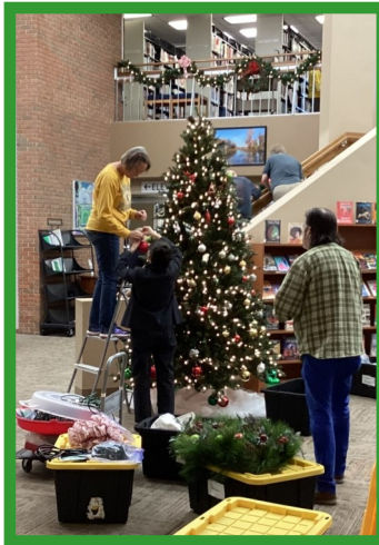
Friends decorating the library for the 2022 Holiday Open House

We invite you to join the Friends of the Library and help us provide the library with those special amenities and items that cannot be acquired through the library's regular budget.