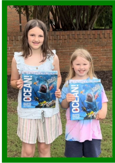
Left: Two young patrons with their new books at the Summer Reads Kick-off Event at DPL.

The Summer Reads backpacks & books were made possible with funds provided by the Friends.