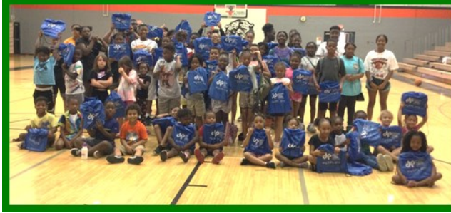
Above: Kids attending Decatur Youth Service's Camp Safe Haven (2022) with their Summer Reads backpacks.

Each child 12 and under received a DPL cinch backpack containing an encyclopedic, age-appropriate ocean book, community coupons, & little gifts (bookmarks, erasers, etc.). Five hundred bags were given away, starting on the day of the kick-off.