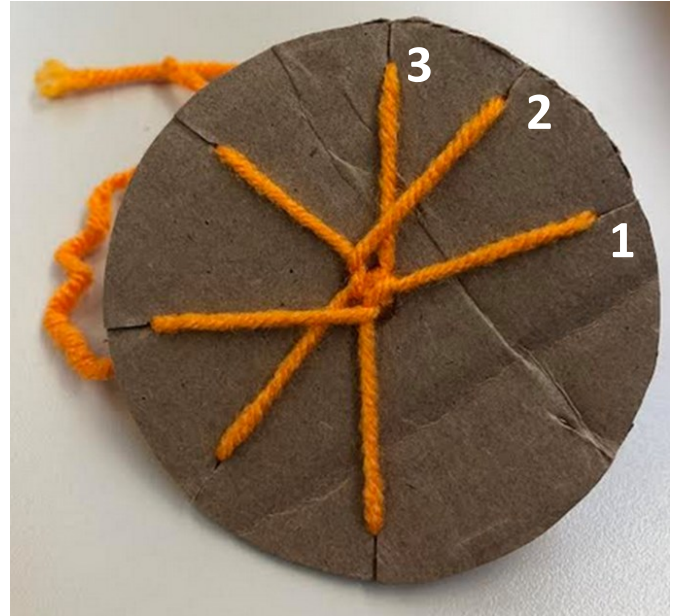
Cardboard piece is cut out with slits and hole in the middle.